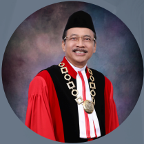
Dr. Suhartoyo S.H., M.H.