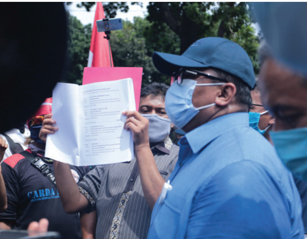
One of the workers showed a request for a test of the Job Creation Law when he wanted to register the application on (2/11/2020) to the Constitutional Court Building.

At the same hearing, the Court also decided on eleven other cases related to the review of the Job Creation Law, namely Cases Numbers 87, 101, 103, 105, 107, 108/PUU-XVIII/2020, and Cases