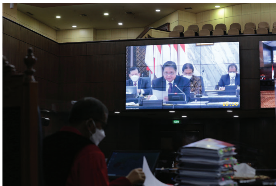
Coordinating Minister for the Economy, Airlangga Hartanto represented the Government in providing information regarding the formal and material test of the Job Creation Law on Thursday (17/6).

"The use of the omnibus law method in preparing the drafting of the Job Creation Bill is to pay attention to the content and substance of the laws that must be amended to reach 78 laws that must be carried out in one unified regulatory substance to achieve the goal of optimal work creation. As for the preparation and process of establishing the Job Creation Act, it follows and fully complies with the provisions stipulated in Law Number 12 of 2011," added Airlangga.