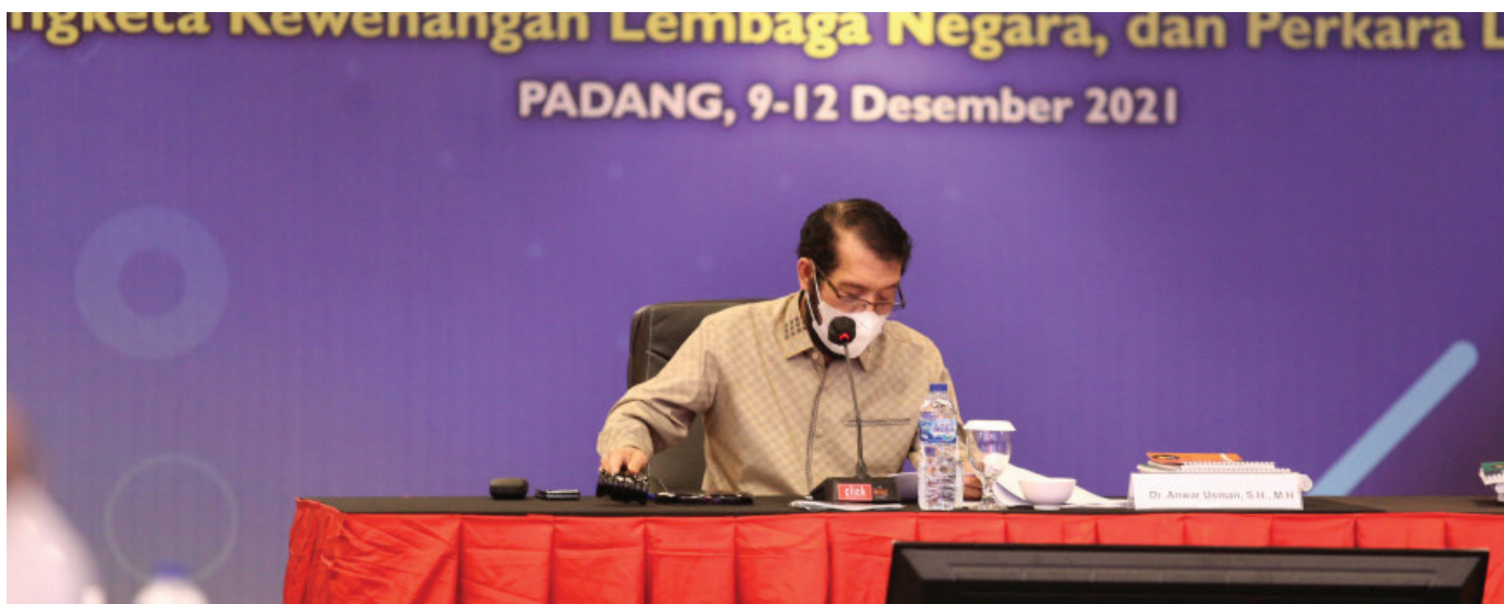
Ketua Mahkamah Konstitusi (MK) Anwar Usman menutup kegiatan Rapat Kerja Mahkamah Kontitusi 2021 yang berlangsung di Padang, Sumatera Barat, Jumat, (10/12/2021).

Court in 2021 was held in Bogor from Thursday, November 25, 2021, until Saturday, November 27, 2021. The working meeting was attended by 332 people consisting of Structural and Functional Officials as well as Employees in the Registrar's Office and the Secretariat General of the Constitutional Court. This year's Working Meeting took the theme, "Improving the Quality of Support for Case Handling and Development of Judicial Technology for the Constitutional Court". The choice of this theme is based on the implementation of the Constitutional Court's Mission and Vision.