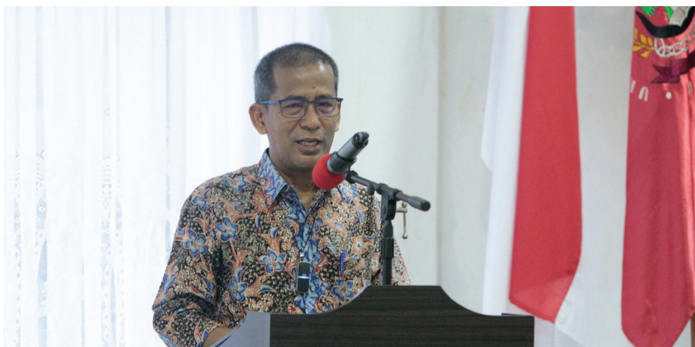
Constitutional Justice Saldi Isra was the keynote speaker in the “Book Review of the Constitutional Court” organized by the Constitutional Court (MK) in collaboration with the Muhammadiyah University of West Sumatra on Saturday (18/12/2021).

“At least for the legal community, the more legal literacy that arises from legal experts, the better it will be for the growth and development of legal literacy in this country. Because, if we look at the existing literacy with such a vast Indonesian state, there are still too few things that are produced by legal experts. Therefore, we at the Constitutional Court take the initiative to write, read, and write because that is what can be produced,” explained Saldi.