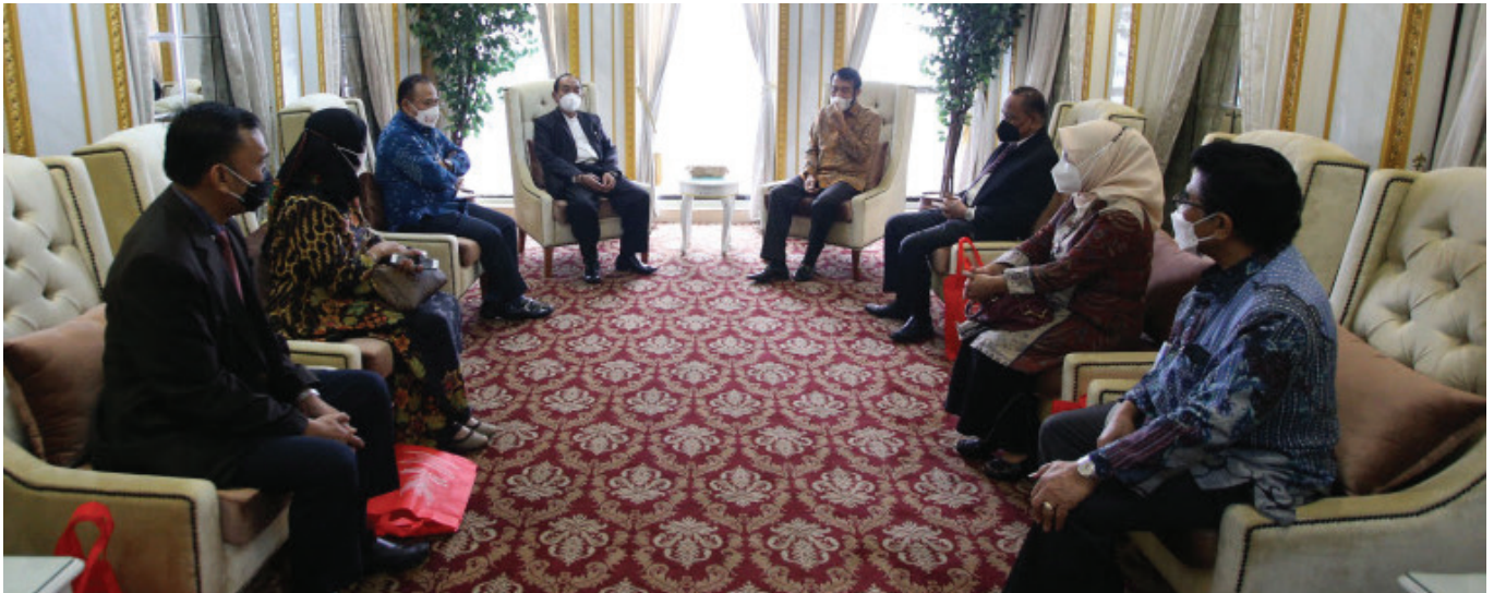
Wakil Ketua Mahkamah Konstitusi Aswanto menerima audiensi delegasi Lembaga Layanan Pendidikan Tinggi Wilayah IX (LLDikti Wilayah IX) pada Selasa (7/12/2021) di Gedung Mahkamah Konstitusi (MK).

the Constitutional Court (MK) and the Faculty of Law, Sebelas Maret University (FH UNS).