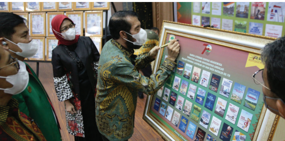
Ketua MK Anwar Usman menandatangani peluncuran dan bedah buku karya literasi civitas akademika Fakultas Hukum Universitas Andalas (FH Unand) diselenggarakan pada Kamis (9/12/2021)