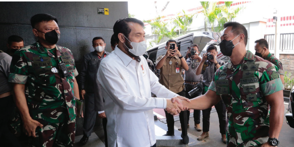
Chief Justice of the Constitutional Court Anwar Usman when welcoming the arrival of the Commander of the Indonesian National Armed Forces (TNI) Andika Perkasa at the Constitutional Court Building, Tuesday (23/11).

TNI Commander,” said Anwar in the Delegation Room of the Constitutional Court.