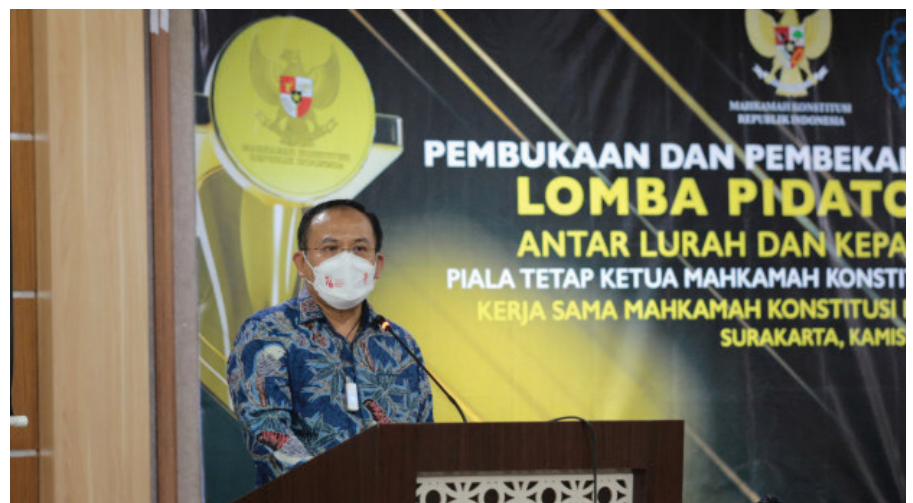
Wakil Ketua MK Aswanto dalam acara pembukaan Lomba Pidato Konstitusi antar-Lurah dan Kepala Desa se-Solo Raya, pada Kamis (2/12/2021).

“We from the Constitutional Court have the honor of being the first institution visited in this task of the