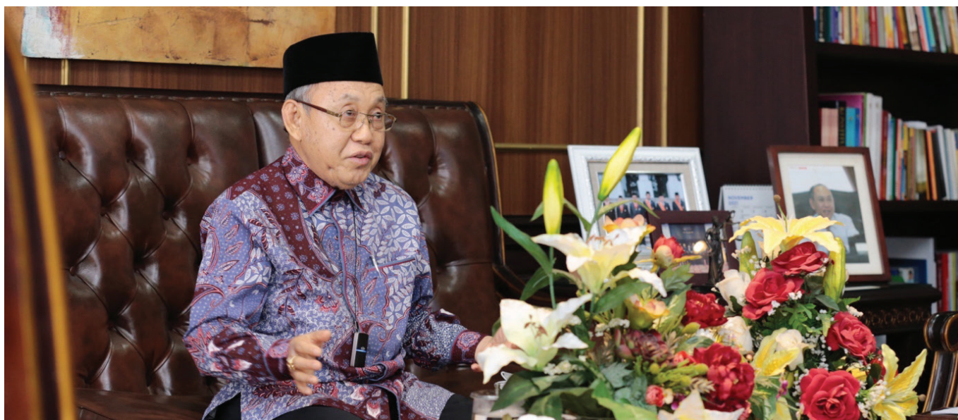
Constitutional Justice Wahiduddin Adams was the keynote speaker at the webinar event organized by the Center for Legal Studies and Consultations, Faculty of Sharia and Law, UIN Sunan Kalijaga Yogyakarta, Tuesday (11/30) at the Constitutional Court Building.

"Article 3 of the 1945 Constitution before the amendment stated that the People's Consultative Assembly had established the Constitution and the GBHN, but now there are none. The political and state administration system based on the 1945 Constitution