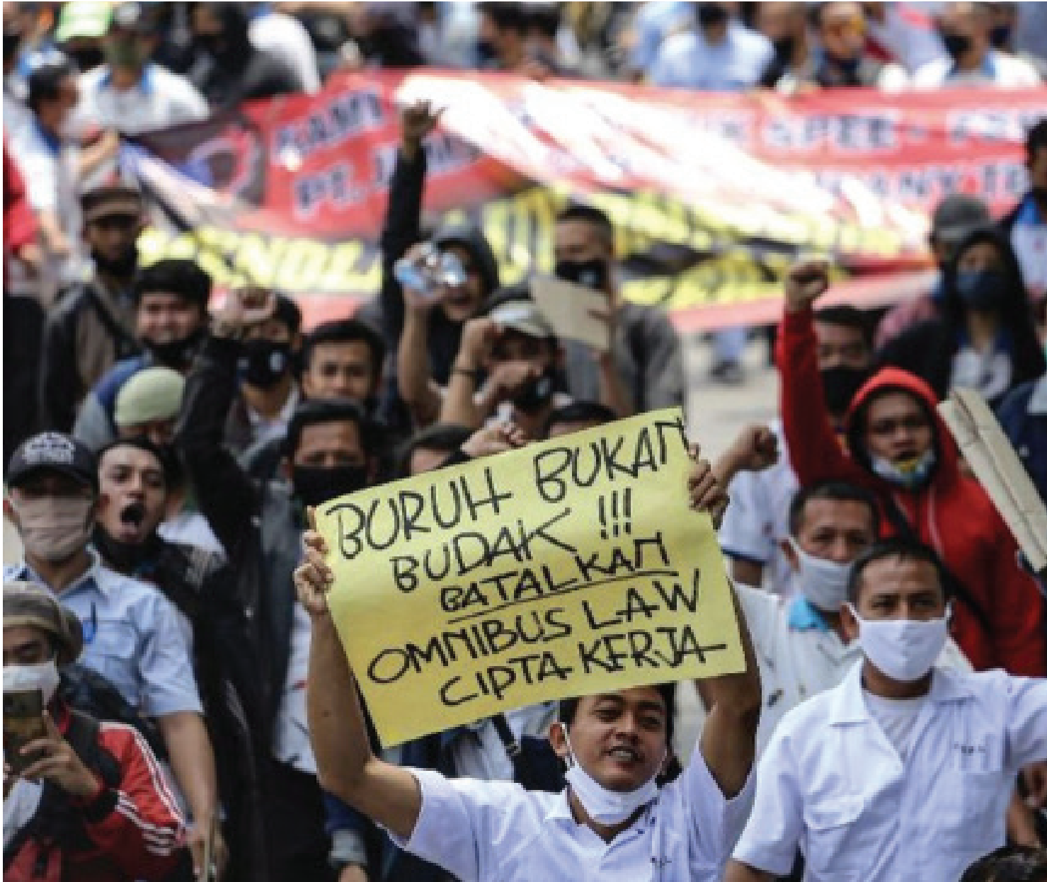
Labor demonstration in Jatiuwung area, Tangerang City, Banten, Tuesday (6/10).